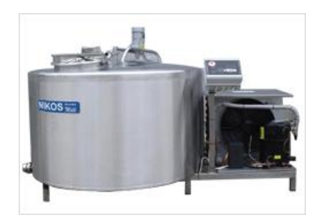
Figure 3: Milk cooler

Cooling does not destroy bacteria or enzymes but it slows down their activity. Cooled raw milk keeps its quality for a few days before it is processed. Milk products such as yoghurt, cheese, butter and pasteurised milk are also cooled to ensure they have the required shelf life for distribution to shops and retail storage. At the smallest (micro-) scale of operation, a refrigerator set at 4-5°C can be used to cool milk, but most dairy processors use a milk cooler (Figure 3) or cold store to cool milk in bulk before it is processed. Finished products should be stored in a separate dispatch store at 4°C +/- 2°C, or for frozen milk and ice cream, frozen in a freezer operating at below -18°C.